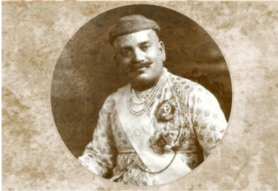
H. H. Maharaja Sayajirao Gaekwad-III